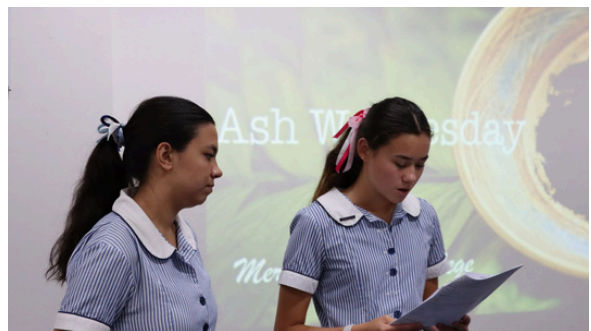
Masses and Liturgies