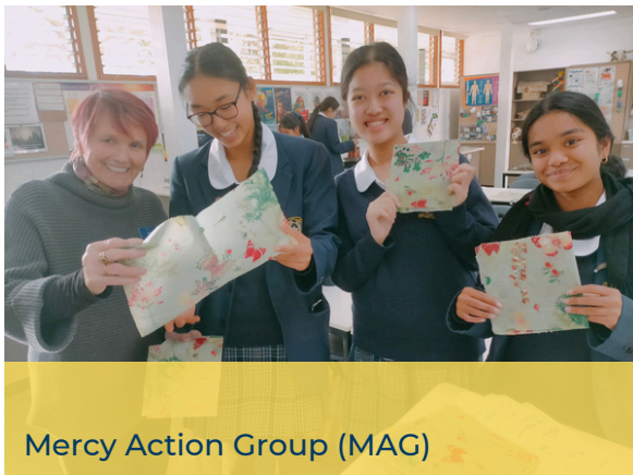
Mercy Action Group (MAG)