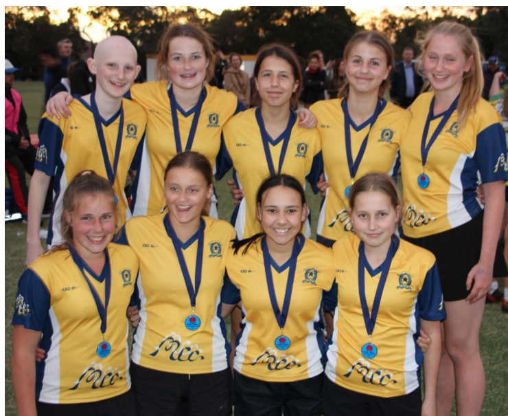
JUNIOR RUNNERS UP