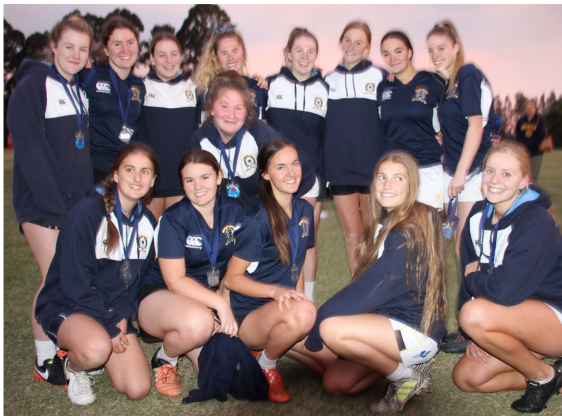
SENIOR RUNNERS UP