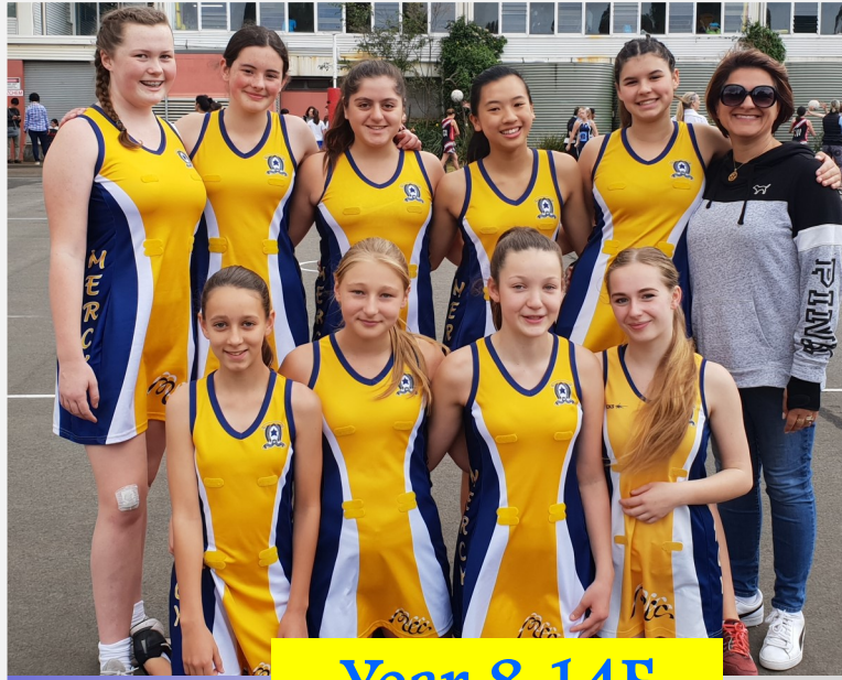
Year 8 14E