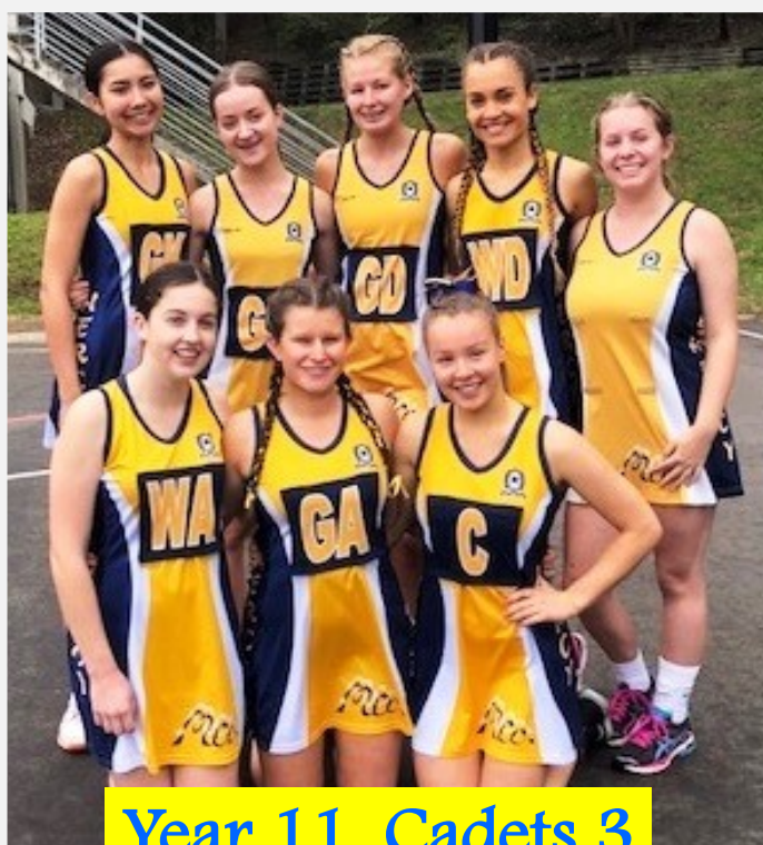
Year 11 Cadets 3