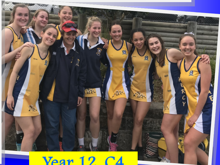
Year 12 C4