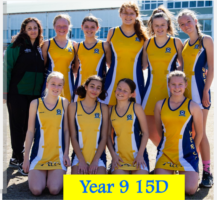
Year 9 15D