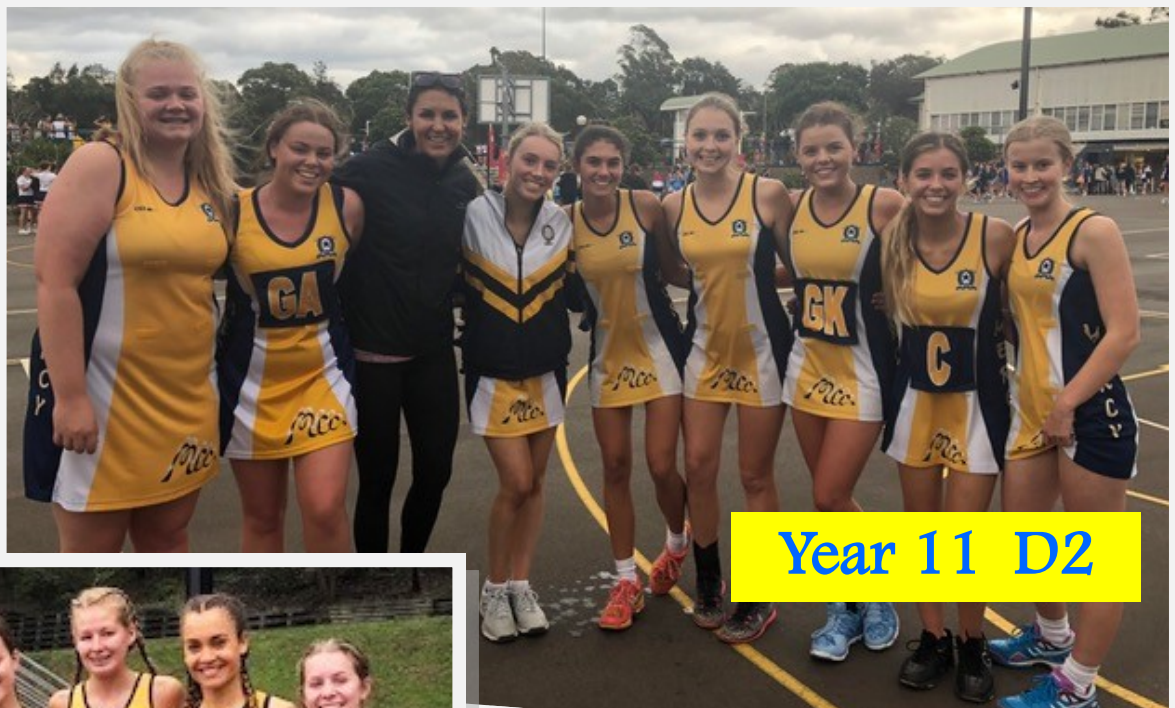
Year 11 D2